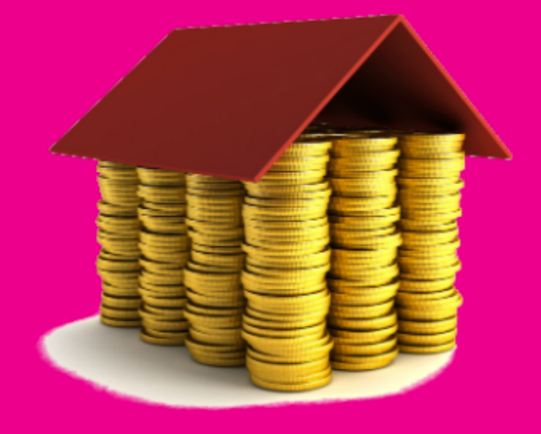
Priceless – future value of your domain